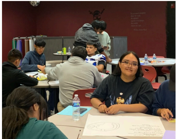
Students collaborating at a Grants Cibola County School

During the 2020-2021 school year, the Everyone Graduates Center at Johns Hopkins University, along with a group of high school teachers from across the nation, co-developed a draft set of 9th-12th grade college and career readiness milestones. The milestones consist of evidence-based, grade by grade (9-12), academic and school success experiences, life skills, motivating interpersonal relationships, and postsecondary preparations. Reaching each grade's milestones increases the likelihood of students making informed decisions about their postsecondary plans as well as being prepared to succeed in their chosen pathways. Distributing the milestones across grades 9-12 engages the whole school in the vital work of putting all students on a pathway to adult success.